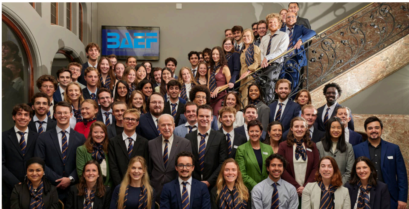
Belgian Boat 2025-2026 & US Boat 2024-2025